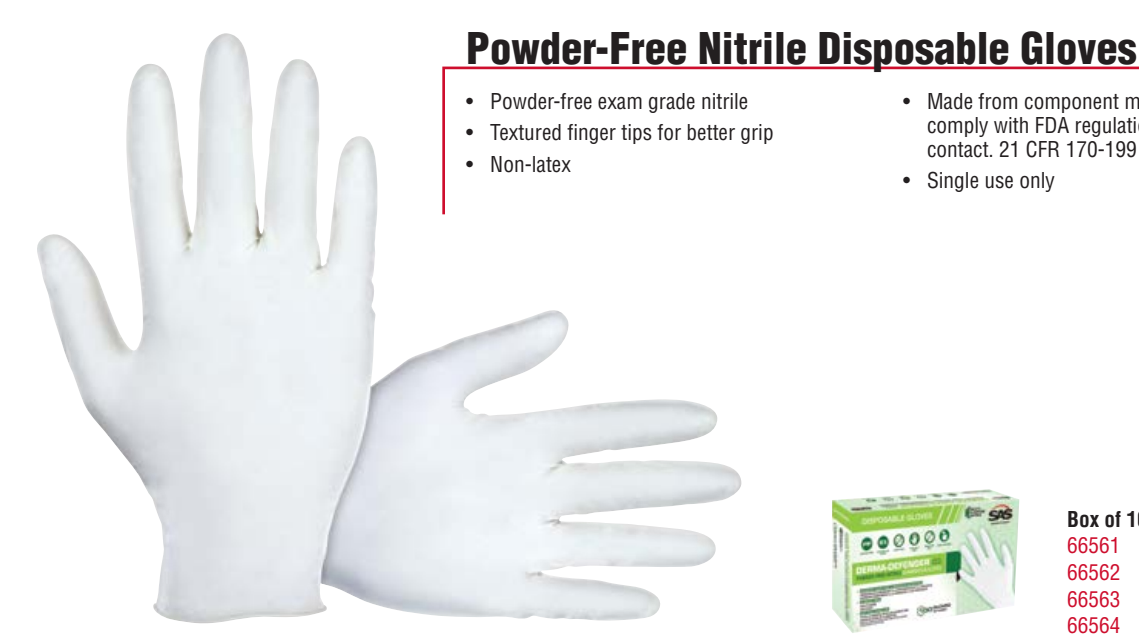
SINGLE USE ONLY